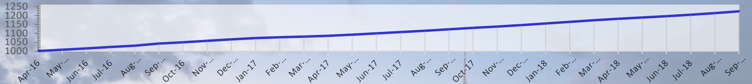
Share Class E - EUR

The Marshall Bridging Fund (MBF) offers investors access to secure and predictable returns from short term financing of property projects in major European cities, focusing on Germany. The fund's returns are not dependent on the rise in value of any property and thus is unaffected by any volatility that may occur short term in the property values.