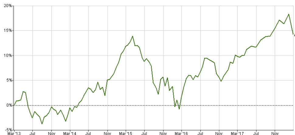
■ A - Frontier - Multi Asset Platform Conservative B USD in US [14.29%]

†Source: Financial Analytics 28.02.13-28.02.18 based on B USD share class.